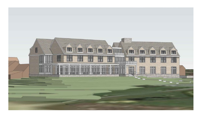
Proposed New Residence Hall