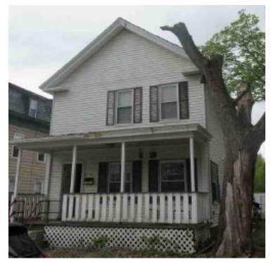
174 Highland Avenue