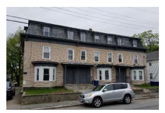
164-168 Highland Avenue